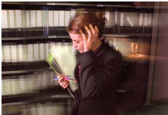
Reality ... we're working overtime largely because we have to / File